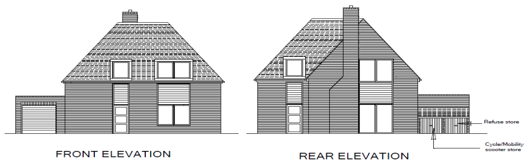
Figure 2 – Front and rear elevation of proposed dwelling