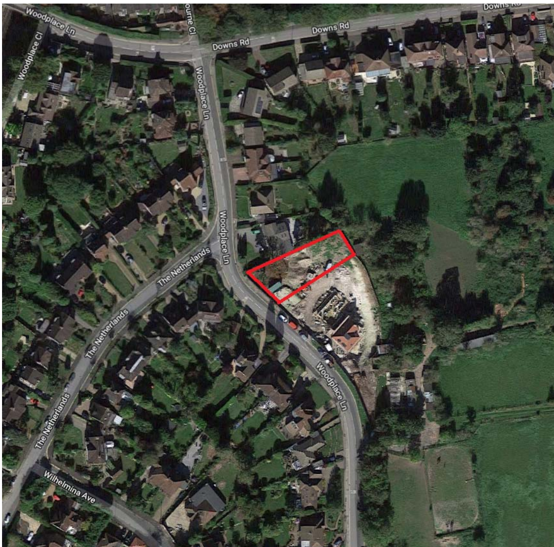
Figure 1 – Aerial view of site